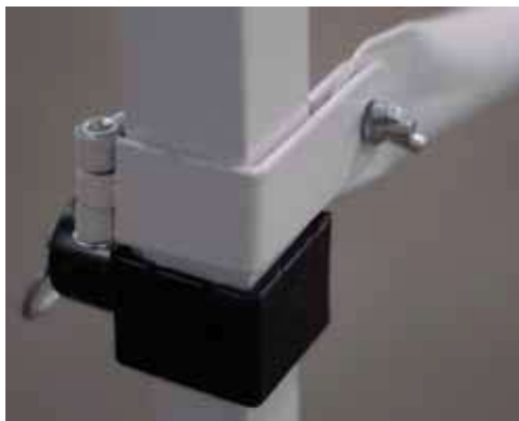
A) Square Leg Steel Frame