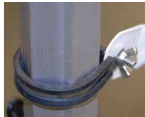
B) Hex Leg Aluminum Frame